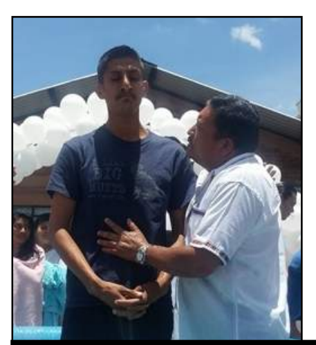
New Believer, saved at a training!

of the recent training are too many for one Prayer & Praise report.